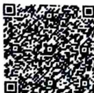
Registrar Pharmacy Council